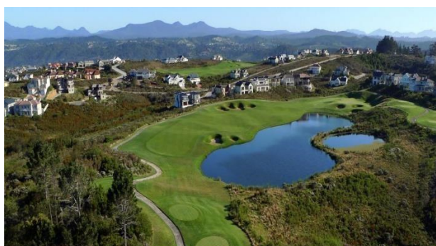
Overnight hotel in Knysna